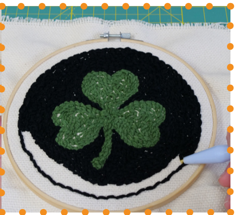
Step 7: Carefully punch needle with Black Yarn around the outside of your Shamrock. Punch needle your way to the edge and trace out the circle. Now fill in the rest of the canvas with Black Yarn.