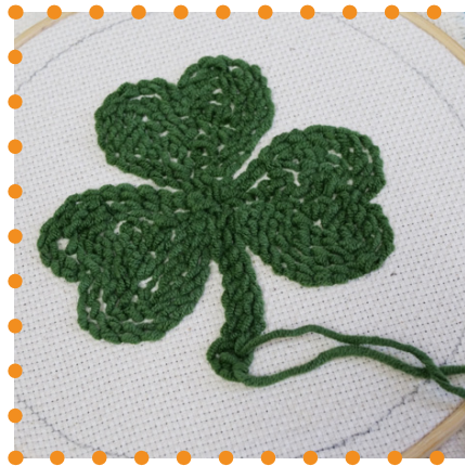
Step 6: Cut off the excess yarn, where you started and ended with the green yarn. Follow Step 1 to re-thread your Punch Needle with Black Yarn.