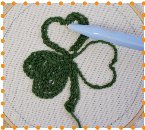
Step 5: Now that you have an outline, proceed to fill in your Shamrock.