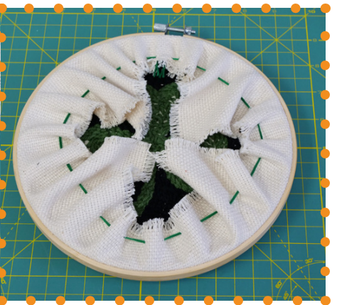
Step 8: Gently remove your completed project from the hoop, flip it around and re-mount to your hoop. (This is a preference, you can decide which side you like best.) Gather stitch the excess cloth together at the back for a cleaner look.